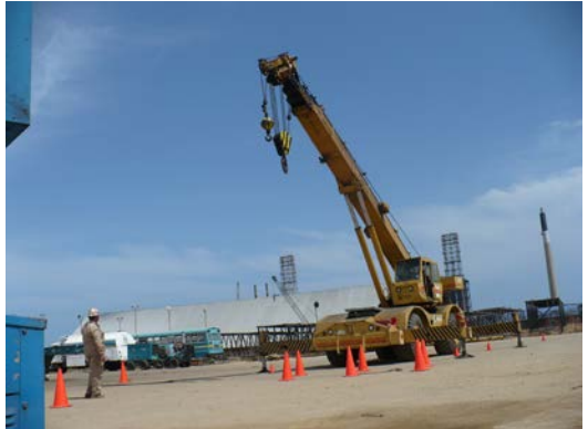
Crane Operator Certification