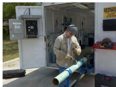
Mobile OQ Trailer for Field PV's

We will travel to you, anywhere, 7 days a week. We pride ourselves on Quality, Reliability, and Availability.